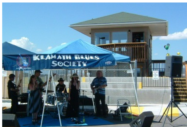
Klamath Blues Society plays at the Fundraiser with the Memorial building in the background.

The most ambitious project this year was the T61 Memorial Fundraiser and open house on August 6th.