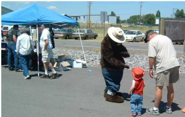
Smokey Bear and Friends at the Fundraiser